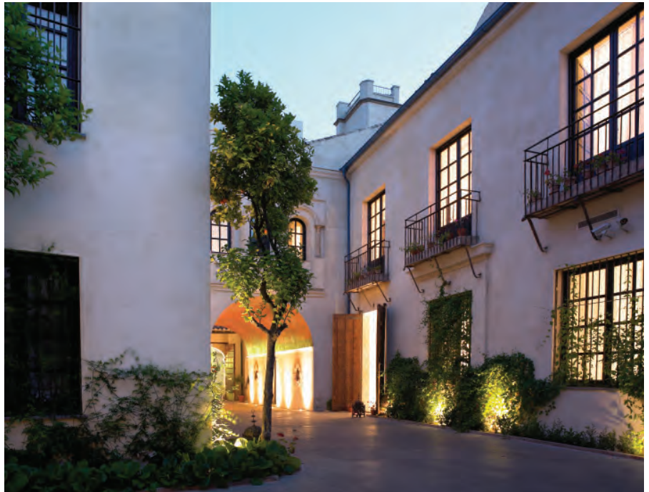
Hospes Palacio del Bailio

In the historical heart of Cordoba, the Palacio del Bailio is set inside an old manor which is made up of several buildings which surround its five patios. On the spectacular main patio, the traditional paving has been replaced by a dramatic glass floor which gives a view to the roman ruins that lie below it. Inside the rooms, original frescoes from the 17th Century have been carefully restored to conserve the historical character of this property. The Arbequina restaurant offers delicious gastronomic delights using fresh, local produce to create traditional dishes. There is also a small swimming pool set amongst the orange trees.