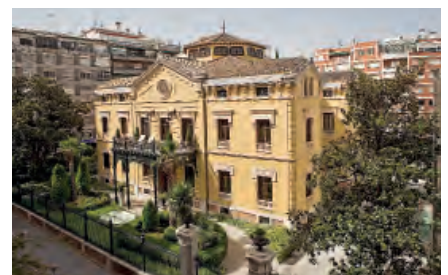
Hospes Palacio de los Patos