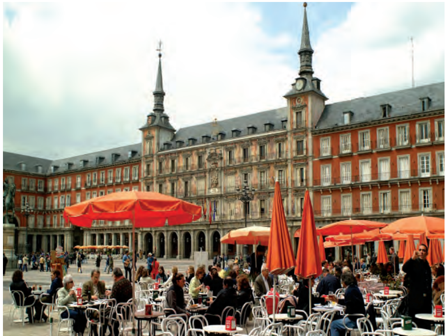
Madrid Plaza Mayor

Entrance tickets are included to Cordoba's mosque – the largest Islamic structure in Western Europe and a UNESCO protected site. The remainder of the day is at leisure to explore Cordoba, and in the evening a romantic "Caliphal" dinner is included - served in the intimate ambiance of the Senzone restaurant.